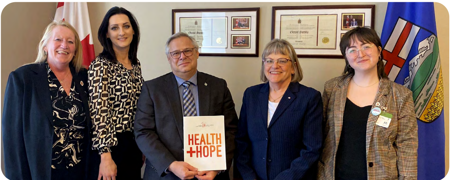
CHC volunteers met with over 60 parliamentarians to promote universal pharmacare and public health care. Ottawa, March 28, 2023.