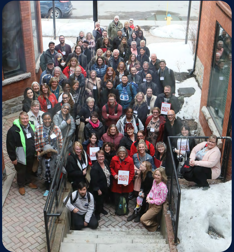
Over 100 volunteers were provided lobby training. Ottawa, March 27, 2023.