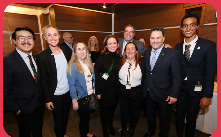
The CHC and NDP Health Critic Don Davies co-hosted a reception on Budget Day to celebrate public dental care and new health care spending. Ottawa, March 28, 2023.