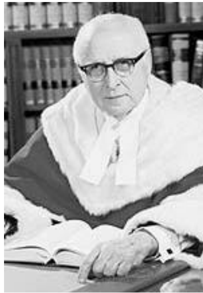
Justice Emmett Hall